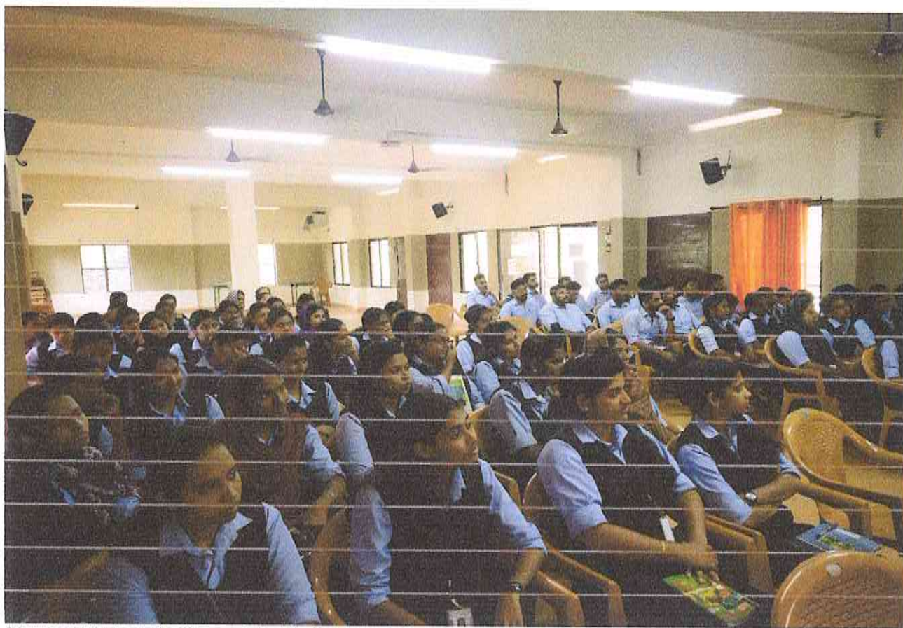
Picture: Student Participants in Various disciplines