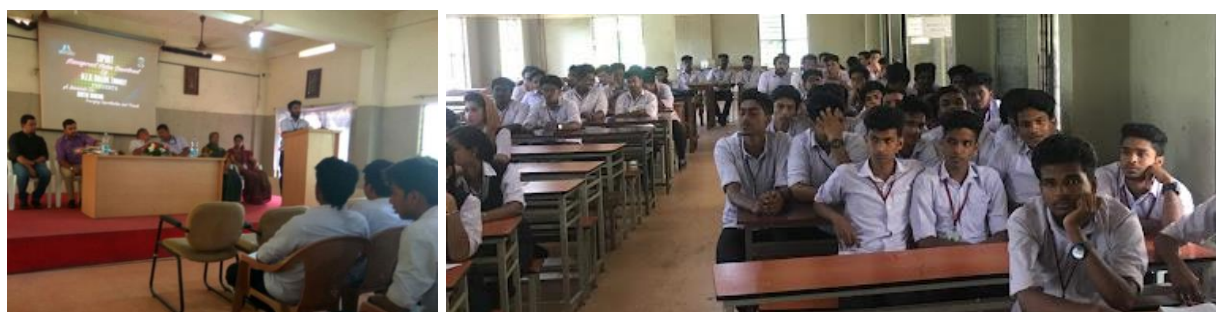
From the Seminar