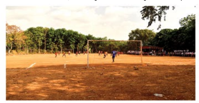
The infrastructure facilities available with the department are: Volleyball court | Basketball court | Football court Shuttle badminton court -2(Indoor) | Cricket pitch | Gymnasium

The Department of Physical Education has devoted itself in the growth of the country through the young citizens of India by means of budding a strong mind and best physique through physical activities. Physical Education, a learning experience offers a unique opportunity for problem solving and self expression and socialisation. A well implemented, comprehensive programme is an essential component to the growth of both mind and body. The Department of Physical Education is well equipped with modern infrastructure facilities, including facilities for all games and sports.