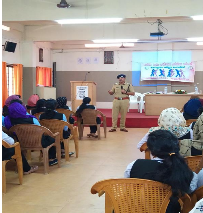
Class on Law for Women delivered by the DYSP of Kanjirappally for girl students.

In January 2020, the Women's Forum conducted a two-day Self Defense workshop for the girl students of the institution. One hundred and fifty students benefited from the workshop. The Women's Forum also arranged a talk by the DYSP of Kanjirappally on Law for Women for the girl students of the institution and an interactive session with the Officer was also arranged.